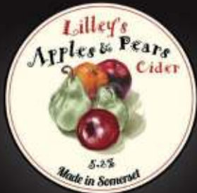
Lilley's Apples & Pears 5.2%

Made from 88% pear and 12% apple. Sweet in flavour with a mouth-watering almost