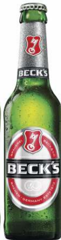
Beck's 24x275ml case