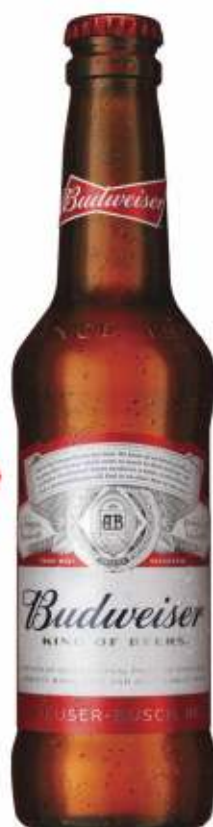
Budweiser 24x330ml case

Terms and conditions: 5 cases must be purchased in one order. Free case is always Budweiser. Offer available whilst stocks last.