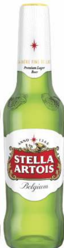
Stella Artois 24x330ml case