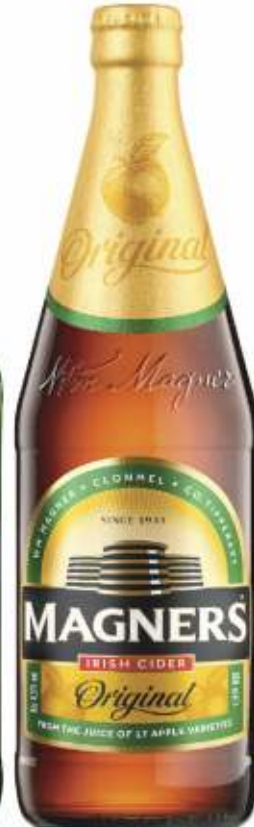
Magners Original 12x568ml case